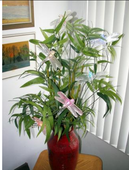
Create a Floral Accent Piece