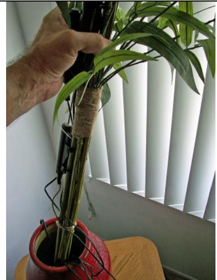
Place Stalks in Vase.