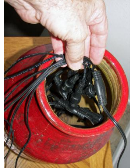
place wires in Vase.