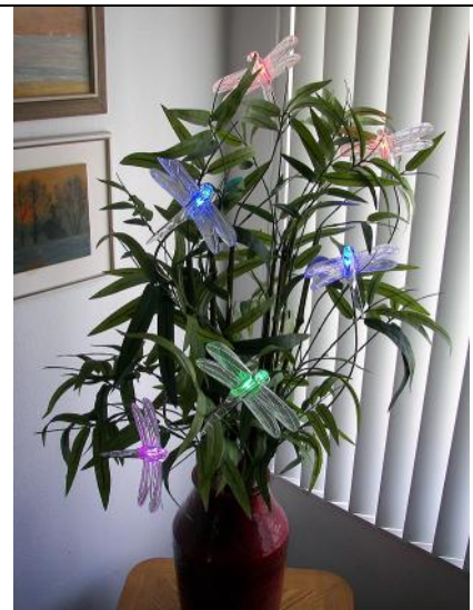
Finished Accent Light