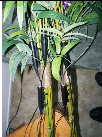
to Bamboo stalks