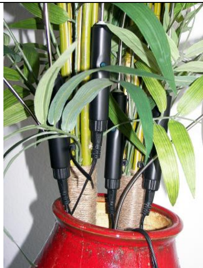
Use foliage to