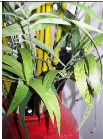
hide control Modules.